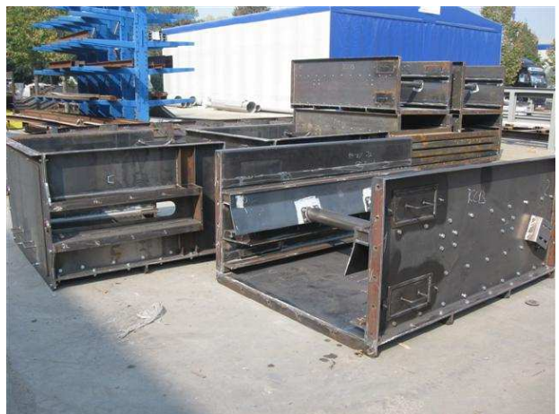
Plate chain and roller are both treatment to increase their wear protection. One case very 2 is equipment with lateral inspection windows needs to remove the joint link or look the internal condition of conveyor. The screws of blades fixing are extractible by the lateral windows.