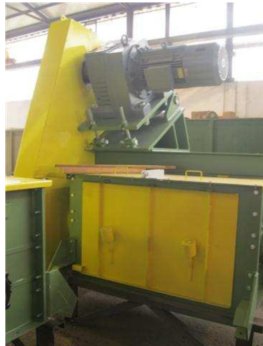
Example of the last drive station built for the Biomass plan.