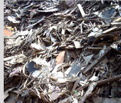
Waste / RDF