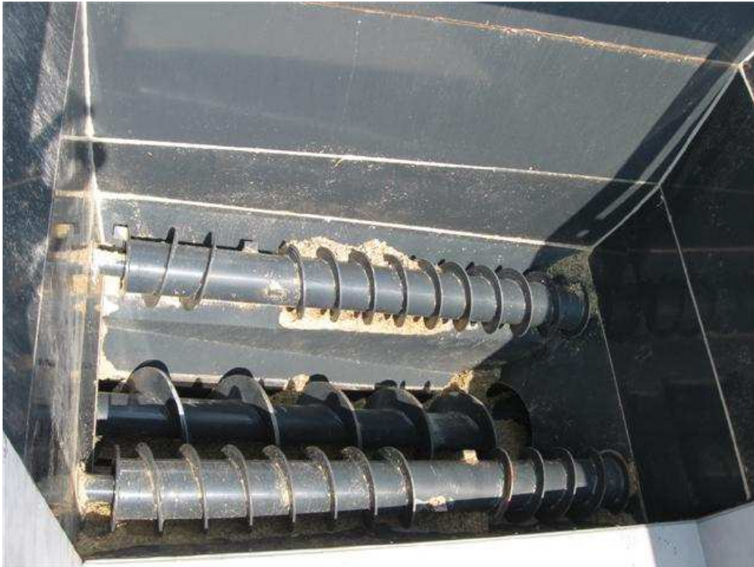
FRESE ROMPI PONTE ED INIETTRICE