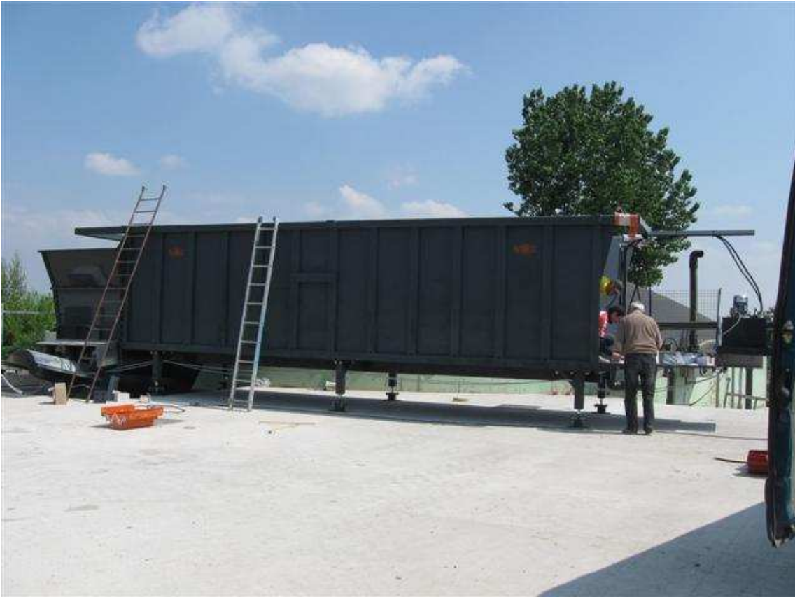
FASE DI INSTALLAZIONE